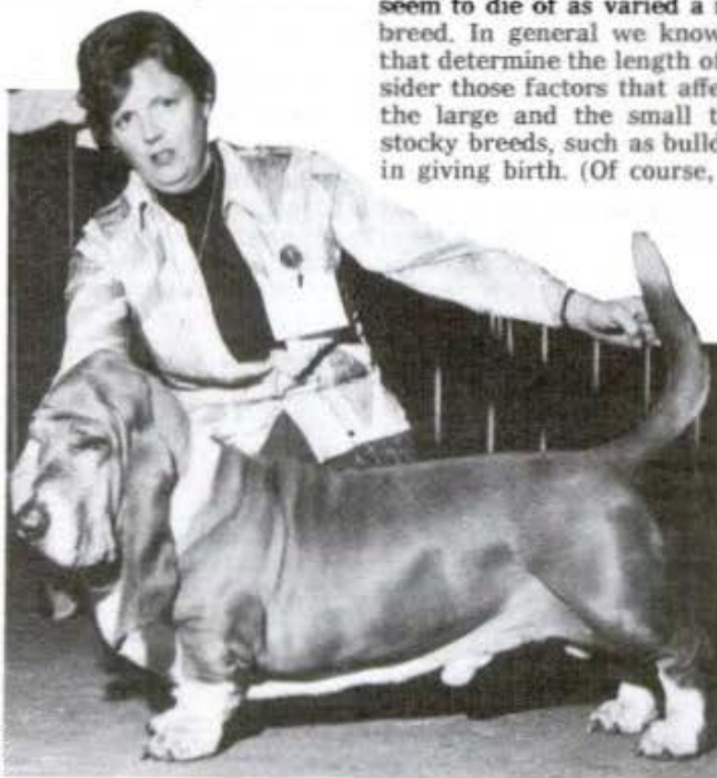
The long, the short and the tall: however endearing, the basset hound (above), the St Bernard (below) and the "child substitute" chihuahua (below) may all be prey to hereditary defects

The list of health problems which may be hereditary that beset pedigree dogs is almost endless. It is hard to know where to start with these problems when there are few well-documented examples. In Chihuahuas and other toy breeds the incidence of hydrocephalus (too much fluid in the brain) is greater than normal; in white poodles, heart murmurs are common; Alsatians and cocker spaniels have a higher incidence of epilepsy than expected; and boxers seem to be unusually prone to several forms of cancer. Tibetan terriers, which are