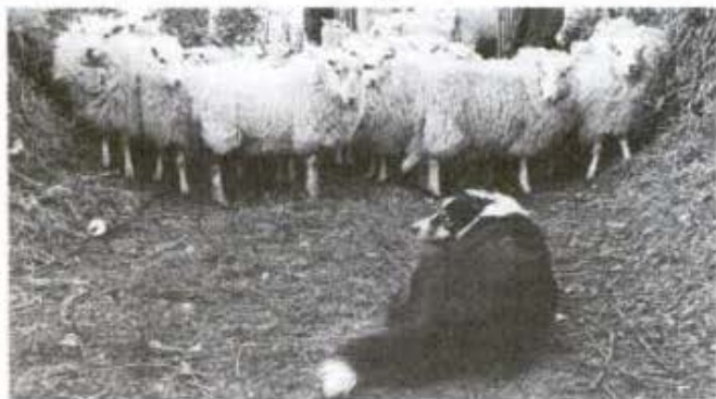
(Above) Border collies have to have their eyes tested before trials; (right) Dogs also suffer from something like Perthes disease

A scheme does exist, however, for the control of progressive retinal atrophy, a condition that affects several breeds and for which the genetic basis is known in most cases. For border collies every entrants in the National