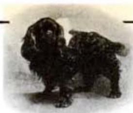
King Charles spaniel

Although few of these problems are fully recognised in the veterinary literature, they often raise some puzzling questions in the comparative medicine of dogs and humans. A good example is Perthes disease, which affects many children each year. In this condition the outer layer of bone at the head of the femur dies, leaving the victim disabled and in pain. There is little evidence that the disease is inherited in human patients. A very similar condition occurs in dogs, but in their case it is confined to certain breeds of smaller dogs, especially terriers and some poodles. This suggests that there is a hereditary link in their case. Children affected with Perthes disease are often skeletally immature and come from poorer homes; the condition is rare in Black children. In man the condition occurs only at the age when the blood supply to the head of the femur depends on blood vessels that run lateral to the bone. In breeds of dog that are